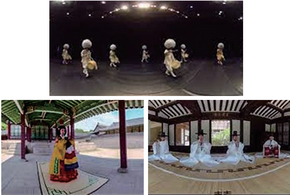
Figure 9. “Gugak VR,” National Gugak Center.

Dance Theater), the Namwon National Gugak Center, the Jindo National Gugak Center, and the Busan National Gugak Center—the repertoire boasts of thirty-seven performances, including court music, pungnyu music enjoyed the upper class, instrumental folk music, vocal music, dance, play, gut (shamanistic ritual), etc. (Kim and Park 2020). 4