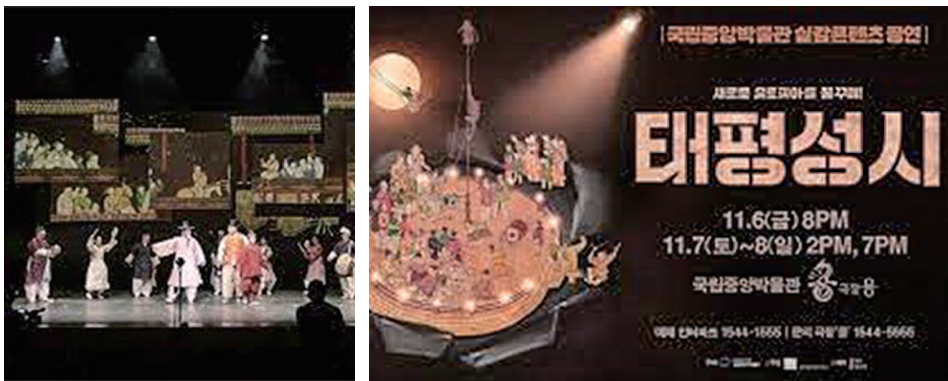
Figure 2. The City of Supreme Peace: Dreaming of a New Utopia , National Museum of Korea.

The City of Supreme Peace: Dreaming of a New Utopia (2020) is the National Museum of Korea's rendition of immersive content performance of cultural heritage. This performance was inspired by the Taepyeongseongsido , a painting of an eight-panel folding screen produced during the late eighteenth-century Joseon period. The painting depicts an ideal society dreamed of by the people of Joseon. Recreated moving images of the scenes portrayed in the old painting compose the main narrative of an ideal world. Three-dimensional projection mapping technology and interactive techniques are applied to create a stage of imagination transcending time and space. Holographic visuals of Korea's cultural assets such as moon jars float around in the air above the stage. They are also fused with modern and traditional music and mask dance. Cutting-edge technology is the key element in the representation of artistic imagination and traditional arts over and beyond the limits of physical stage setting. Combined with immersive visual technology and stage performance, appreciation of cultural heritage and relics is no longer static or two-dimensional, and they are "experienced