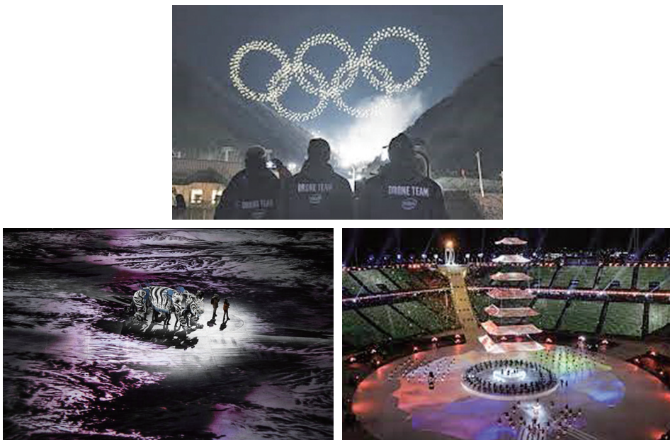
Figure 1. The Pyeongchang Winter Olympic Games, Opening Ceremony.

Part 1, “ Arirang: The River of Time ,” began with the song of Jeongseon Arirang by Kim Nam-gi, an artistic skill holder. As a raft appeared on stage, the image of a buckwheat field was presented in projection mapping. Waging through the turbulent modern history signified by the buckwheat field, the raft serenely flew along the history depicted by roars of joy and sorrow. The AR rendition of bright fireflies winged up in the air. Part 2, “All for the Future” started with the performance of the LED-lighted Gate to the Future and displayed various scenes of the future in holograms and ended with the Media Link, a large-scale LED light column, showing above the stage. Part 3, “Peace in Motion” began with candlelight and dove-shaped balloons and AR doves flied together into the sky. The five-ring Olympic flag created by 1,218 drones roaming in the space declared the opening of the Olympic Games in the dark sky of winter night. In the opening ceremony, traditional