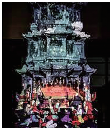
Figure 7. “Lighting the Sky Pagoda,” National Museum of Korea.