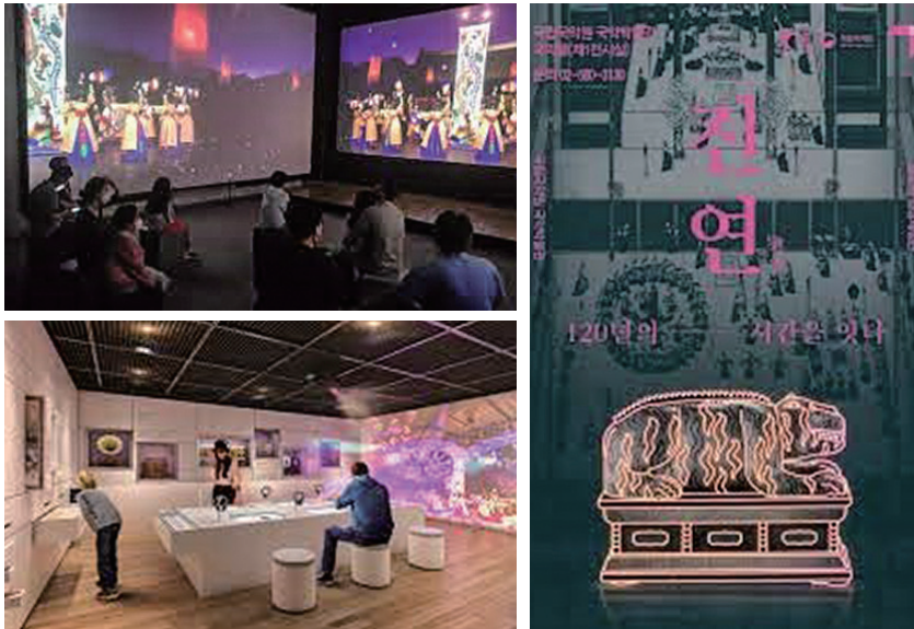
Figure 10. Experience exhibitions, Gugak Museum.

Released in 2021, the two-part immersive visual content, "Royal Banquet, Connecting the Times of 120 Years," recreates the royal banquet that was originally held at Hamnyeongjeon hall of Deoksugung palace in 1902, through three-dimensional videos on three screens. This banquet was to celebrate King Gojong's entry into Giroso, a society of senior officials of the royal court who offered advice on state affairs, as depicted in the Imin jinyeondobyeong kept at the National Gugak Center. In addition, by