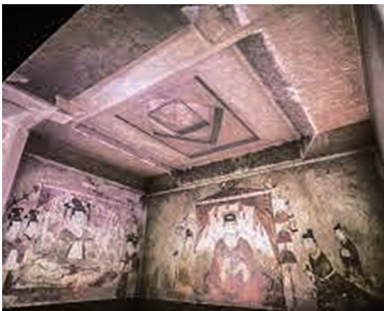
Figure 6. “Goguryeo Tomb Murals,” National Museum of Korea.

“Lighting the Sky Pagoda,” created by projecting images on the exterior of the Ten-Story Stone Pagoda from Gyeongcheonsa Temple, uses the media facade, projection mapping, and AR technology. The images on the surface are designed to unfold stories of the carvings made on the pagoda’s foundation and ten-story main body, including Buddhist symbols, the Western Pure Land, Xiyouji 西遊記 (Journey to the West), Sakyamuni’s nirvana, Buddhist services, and the truth of Mahayana Buddhism. By installing the museum app on a mobile phone, viewers can appreciate the carvings and iconography via AR (National Museum of Korea).